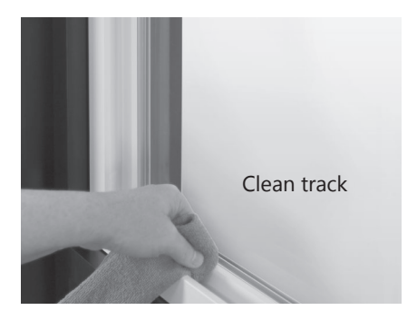
SAFETY - With any maintenance, please make sure you take the appropriate safety precautions while performing these task.