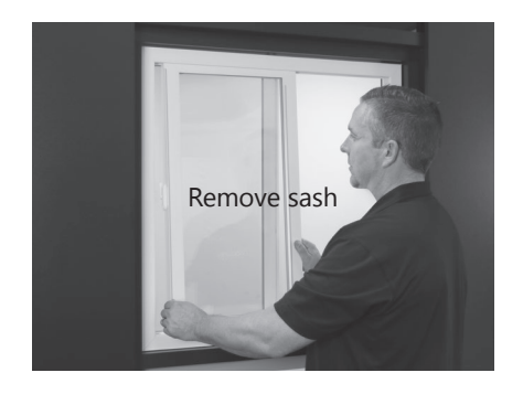
Step 2 - Slider Window

Using a stiff putty knife, pry the track out between the track and frame. Clean the track using a non-abrasive cloth on both sides with soap and water.