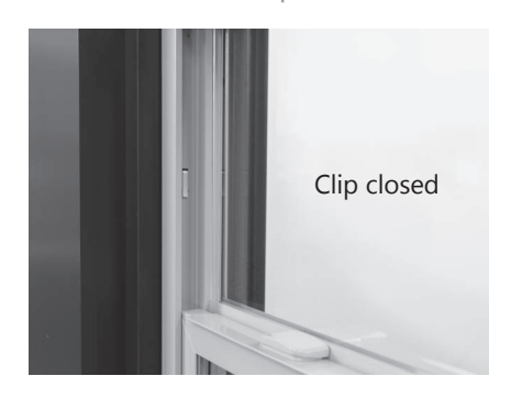
Step 4 Push the takeout clips back to the closed position.