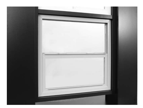
SAFETY - With any maintenance, please make sure you take the appropriate safety precautions while performing these task.